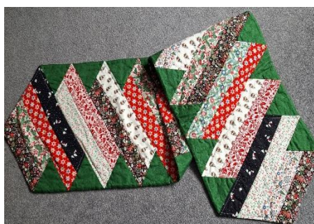
Table runners are not just for Christmas! They are a lovely way to brighten up your table, whether you are having guests round or just want to it to look pretty. Emma will be sharing numerous easy designs for quick and easy table runners both for Christmas and all year round (they can also be adapted to make a bed runner) and they make ideal presents too.

Friday 25 th October 10.30am to 4.30pm £50