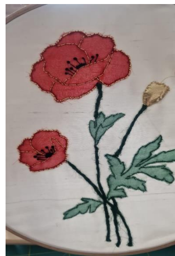
Table Runners with Emma Randall – Level All

Poppies are such emotion evoking flowers so why not make this stunning goldwork version to treasure forever with Wendy? You will learn felt padding, apply leather kit, couch metal threads and French knots combining a range of techniques to complete the project. There will be a kit provided on the day (£10 extra payable direct to the tutor) which contains everything you need. You may want to bring a 10" hoop to take your project home in (optional).